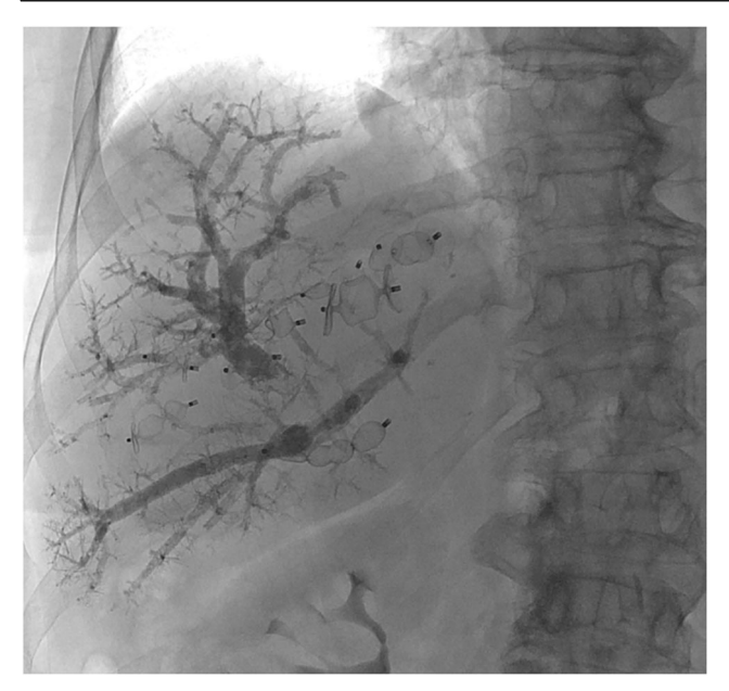
Fig. 1 CT scan of a patient using multiple AVPs for right-sided hepatic vein embolization

a mean of 43 days (SD \pm 15) due to the slower hypertrophy (p < 0.001). During that time, 16% in the TSH cohort had tumor progression, and 27% demonstrated insufficient liver growth. Interestingly, in a follow-up evaluation [34], the ALPPS cohort also demonstrated an improved median survival of 46 months compared with 26 months after TSH (p = 0.028). For the first time, the LIGRO trial demonstrated an effect of a surgical resection technique on survival in metastases surgery based on randomized data. It appears as if rapid resection of the entire tumor load in CRLM matters.